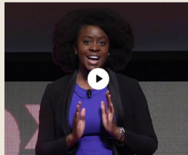
TedX Talk: Mentorship & Workplace Equity Takes Work